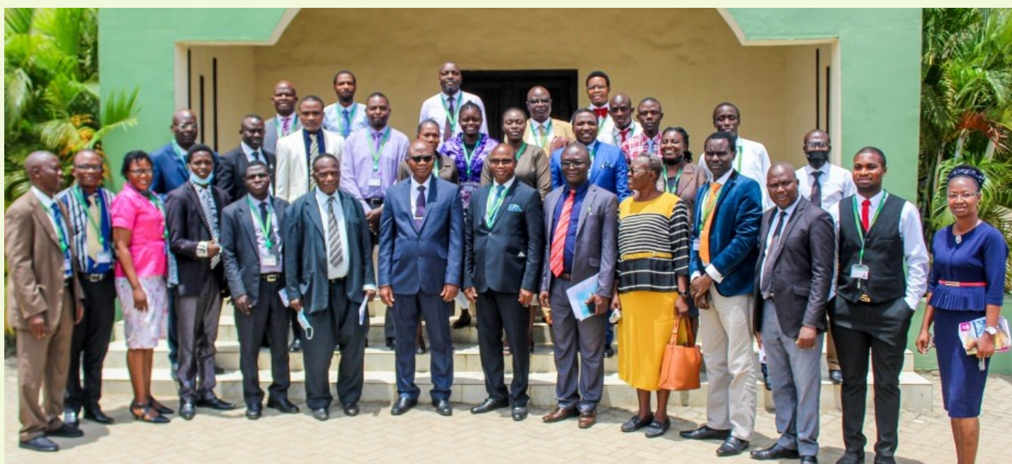
Guest speaker, MTU Staff and Invited Guests at the end of CBAS Annual Lecture and Journal launching