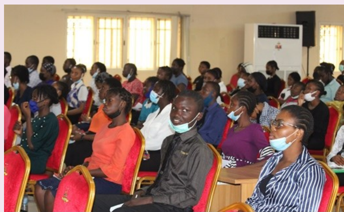
A cross-section of students at the event