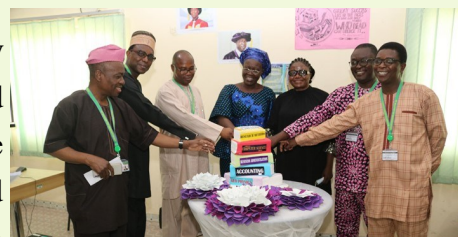
Management Staff and the Guest speaker

The beautifully designed World Book Day cake was cut and there was group photographs and refreshments.