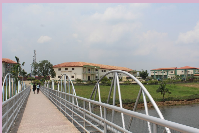
A view of the University Library and Central Administrative block from the MTU Pedestrian bridge

at Mountain Top University. The lecturers gave the students tests which were followed by examinations at the appropriate time. Although these activities were carried out physically, strict covid-19 protocols were adhered to all over the campus. It is on record that since Mountain Top University was established, the institution has steadily and forthrightly maintained a stable academic calendar without disruptions. In this way, the University has become a signpost for progressive academic activity in the country. Perhaps, there must be something that the management of the university is doing correctly to ensure such an enviable, progressive, uninterrupted academic calendar. The consequence of these developments in the university is the graduation of students at the right time. During the first semester exams, there was regular power supply all over the campus both in the lecture halls and the students' hostels. This made it easy for students to prepare for their examinations and lecturers to effectively do their official duties without interruptions. The collation of results has since been concluded and the second semester commenced in earnest. The progressive, uninterrupted academic activities at Mountain Top University deserve commendation and should be emulated both by the government and other private universities. As the second semester starts, it is hoped that it will be completed at the right time with a successful conclusion of the 2020/2021 academic session.