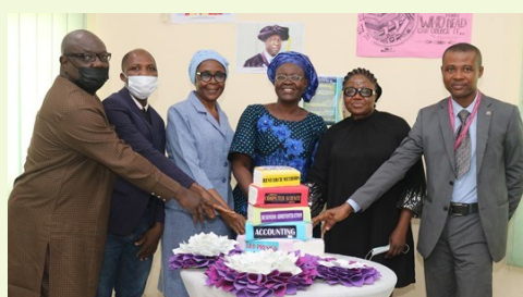
MTU Librarian (3rd from left), the Guest speaker and some invited guests

Some of the dignitaries at the event as recognised by the Moderator are the Vice Chancellor,