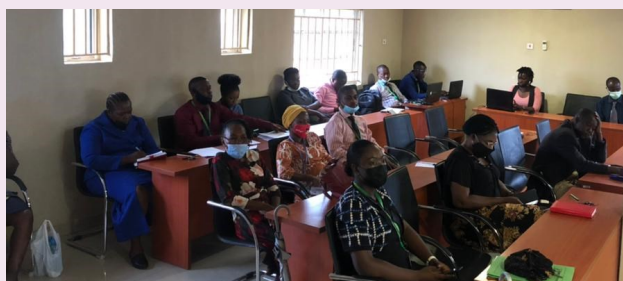
A cross-section of Attendees at the 3rd CBAS Monthly Seminar Series