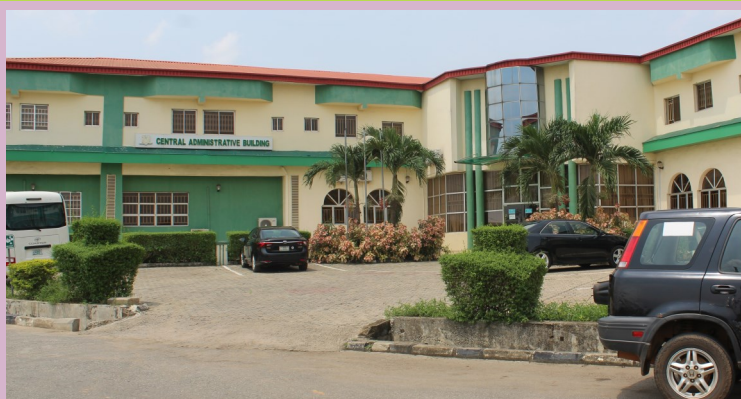
Sectional view of MTU Central Administrative Building

The narrative of the tertiary education system in Nigeria does not excite or inspire. This is because academic activities in Nigerian universities, polytechnics, and sundry higher institutions of learning are always disrupted due to incessant strikes, violence on campus or other reasons. The inevitable consequence of these developments in Nigerian universities is the prolonged period spent by students while studying their various academic courses and programs. It is common in Nigeria to see students spend more years studying a course than the normal number of years originally stipulated for that course. This development burdens society, parents, and the government. Even some private universities have had causes to postpone academic activities in their various campuses due to one reason or another. It is for this reason that completing a semester or a full academic session successfully by any university deserves to be celebrated. Given the prevailing anomalous situation in our country, it is indeed a big feat for any university, private or public, to run a smooth academic calendar without interruptions. It is in this light that Mountain Top University must be commended for always completing semesters and sessions despite all odds. The first semester of the 2020/2021 session was completed successfully