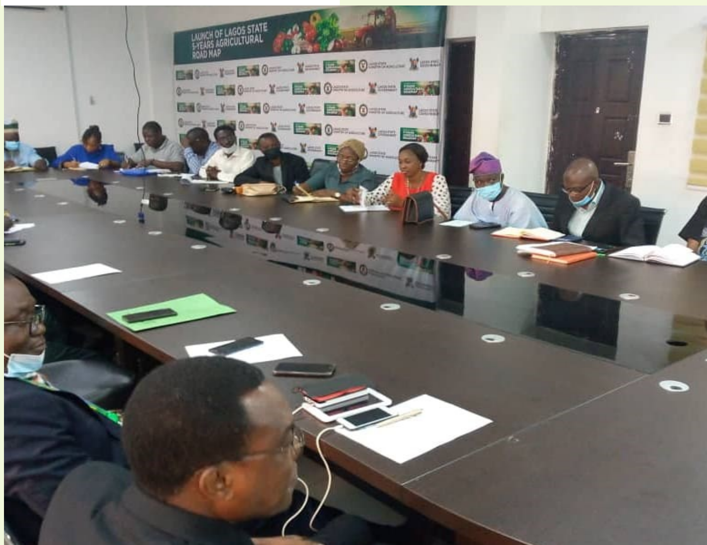
Collaboration meeting between Lagos State Ministry of Agriculture and Mountain Top University

This is a big feat accomplished in line with Mountain Top University's mandate of excellence. The University will continue to grow and make impact in the society. (Culled from: https://facebook.comfollolasg )