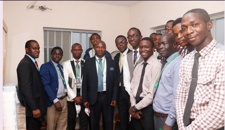
The Vice-Chancellor, Chaplain and Dean Student Affairs and some SRC Members