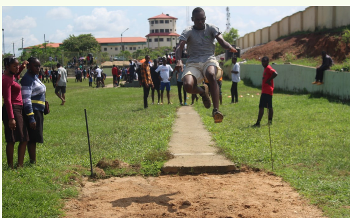
A male student participating in the long jump competition