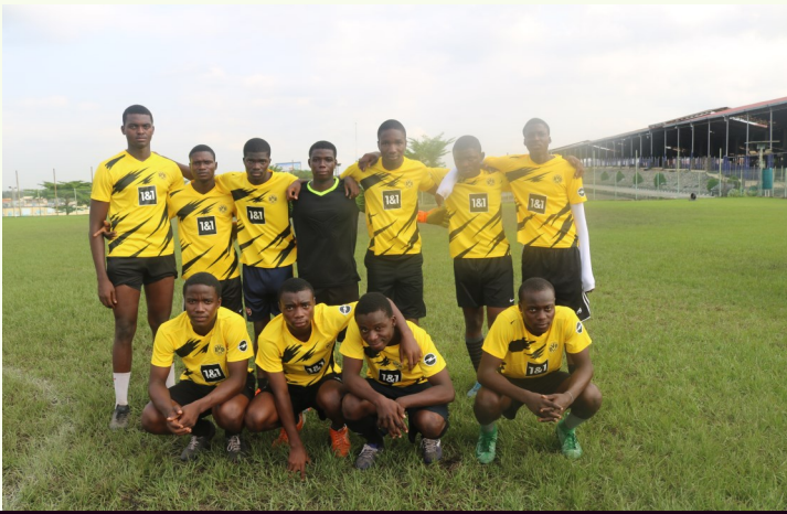
The 200L students male foot ball team line up at the MTU sports festival of the 2021 students' week

A s a means of engendering social interaction among the students in Mountain Top University, a full week was devoted for the students and is tagged 'Students' Week 2021'. It was a fun-filled week with lots of interesting activities lined up such as sporting activities, variety shows, talent hunts, students' competitions, award