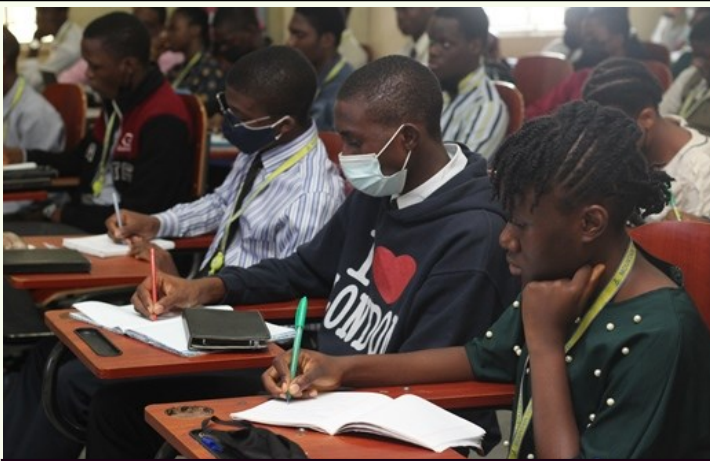
A cross section of computer science students at the workshop