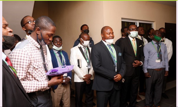
Prayer session during the commissioning of the new salon at the New Daniel hall

It is a thing of joy that these future leaders showed great leadership through this magnanimous donation of theirs and it is hoped that the barbing salon will be put to good use.