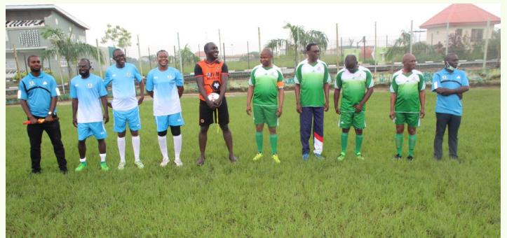
Management team (Green Jersey) vs HOD/Coordinators team (sky blue jersey) line up and the match officials for the football match

As part of the closing ceremony for the sports fiesta, two events stand out: the female staff race and the five-a-side football match between the management