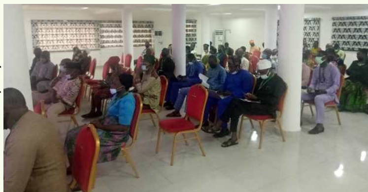
A cross section of participants at the sensitization programme organised by the Quality Assurance team