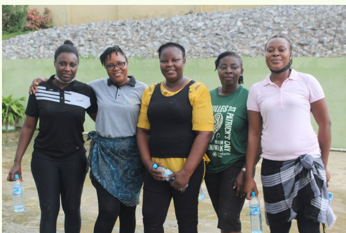
Some participants at the female staff race

team and the Heads of Departments' team. For the female staff race, it was an eye opener seeing the ath-