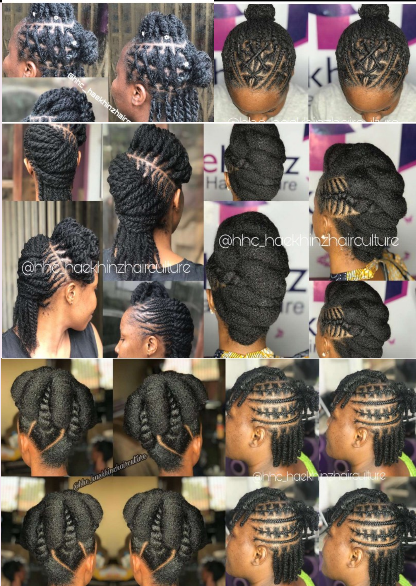
Some MTU Compliant Hair styles