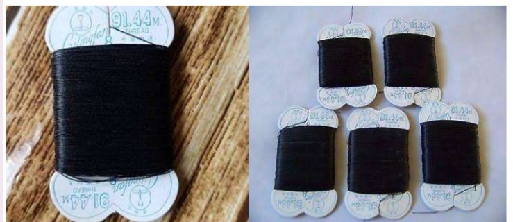
CEILING FAN THREAD

The CEO of Haekhinzh Hair Culture towards the later part of her presentation gave the audience the instruction from the Chancellor, Dr D.K. Olukoya on the use of Wool. The Chancellor states thus: "I have told the VC our stand: owu ti awon Iya wa fi n ko Irun ni aye atijo, oun ni mo recommend, won ko gbodo fi create extension. Any wool apart from that we have to stand against it."