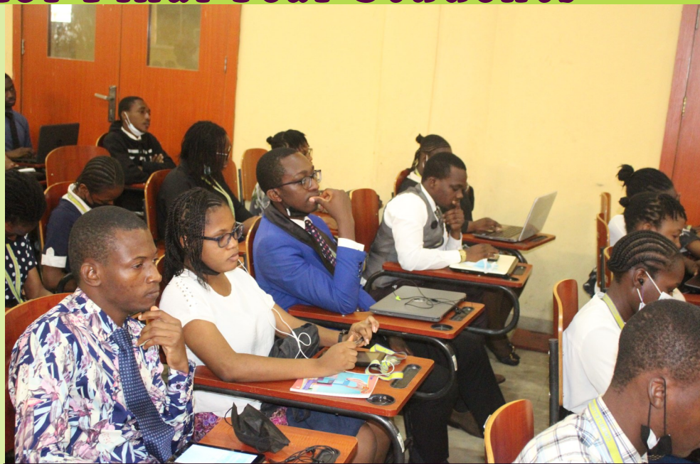
Cross Section of Final Year Students at the 2021 Employability training organised by the Center for Entrepreneurial Development and General Studies (CEDGS) of Mountain Top University

The Center for Entrepreneurial Development and General Studies (CEDGS) of Mountain Top University, as one of the cardinal activities of the center, organised an employability training seminar for the final year students of the University. The five-day event (21st - 25th June, 2021) was organised in partner-