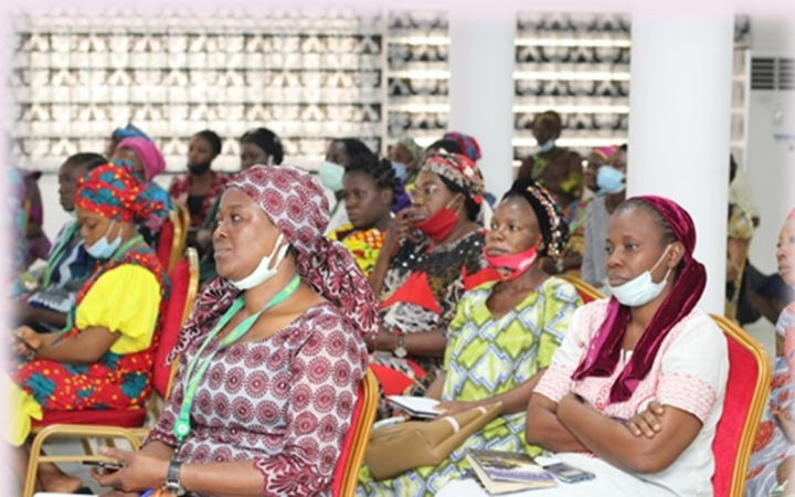
Cross section of MTU Female Staff at the Seminar on MTU Compliant Hair Style and Management