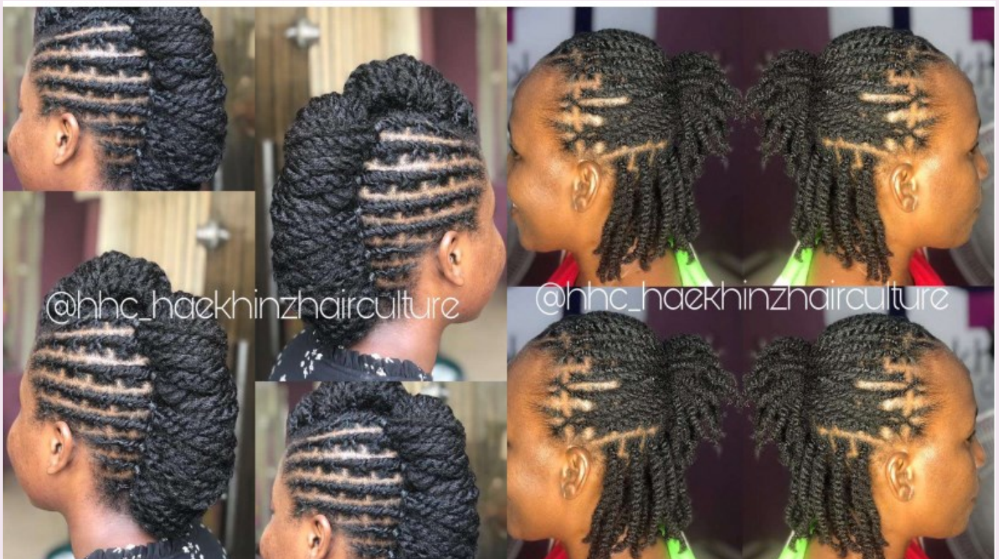
Some MTU Compliant Hair styles