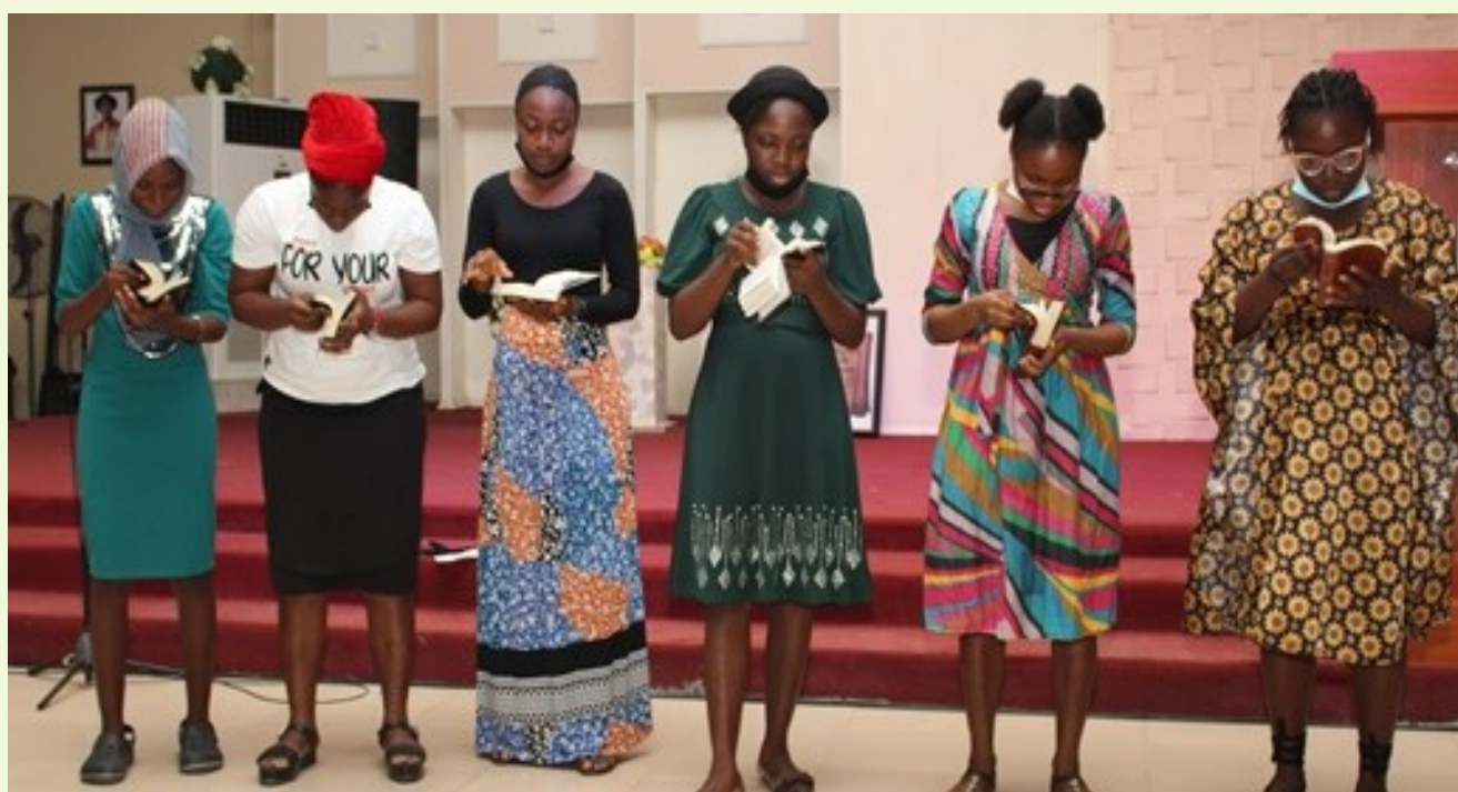
Students Participating in a Sword Drill Session