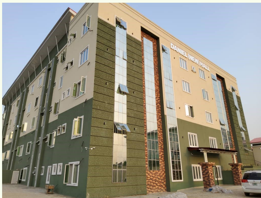
The new ultra-modern male hostel, - New Daniel Hall