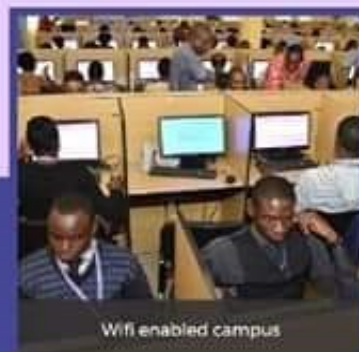
Wifi enabled campus

FOUNDATION AND PRE DEGREE PROGRAMMES ALSO AVAILABLE